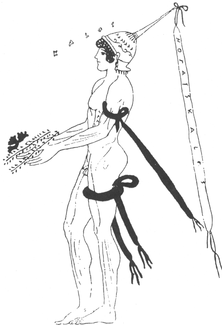
Figure 1 Victorious athlete holding branches and wearing fillets. Detail of red-figure amphora by Douris. Early fifth century B.C.